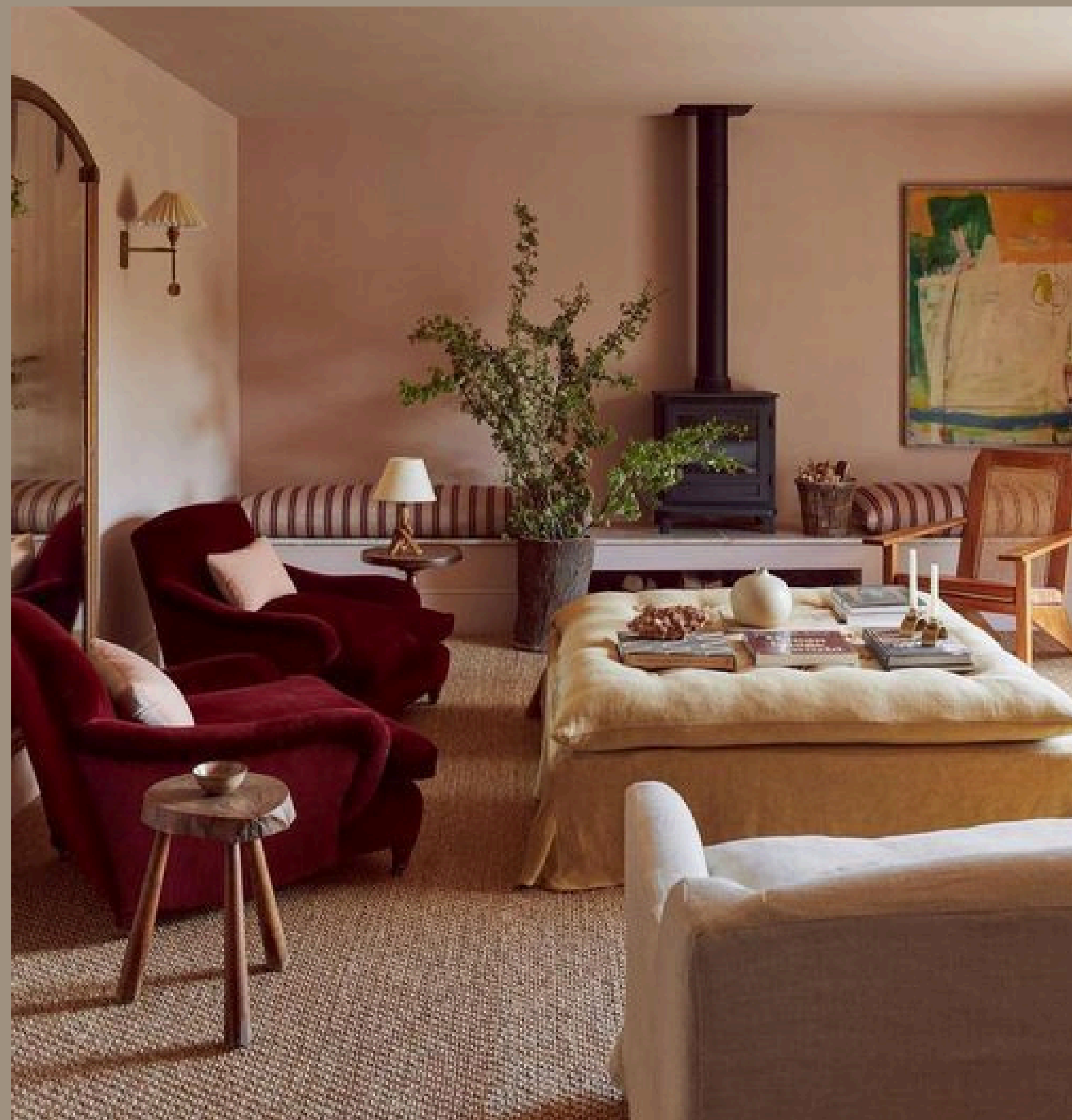
DESIGN CRED: THEA SPEKE

Great for people who could use a hand with the basics, like figuring out layouts and choosing paint colours.