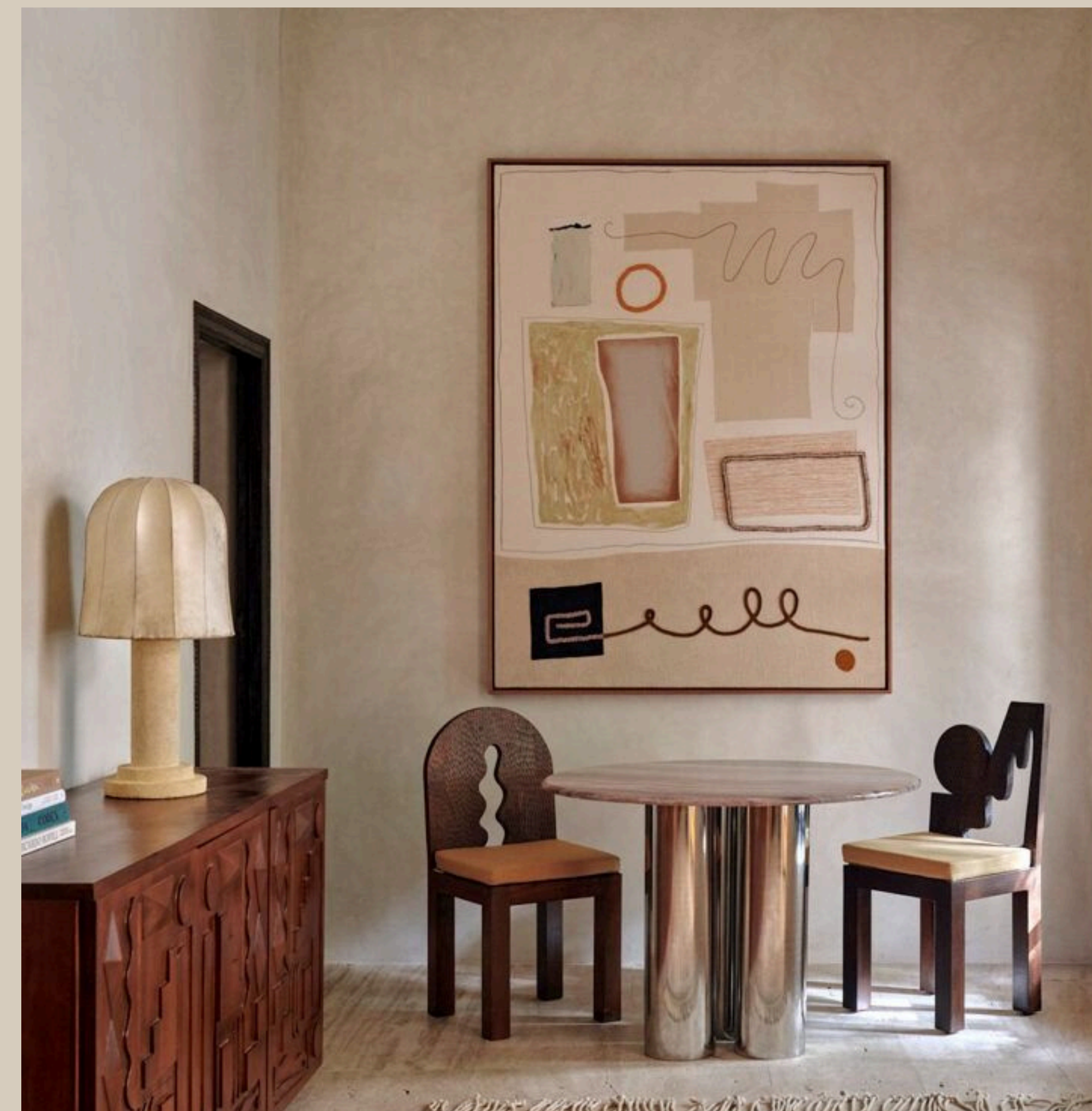
DESIGN CRED: SIGHT UNSEEN

For individuals seeking advice on essential items & layout arrangements