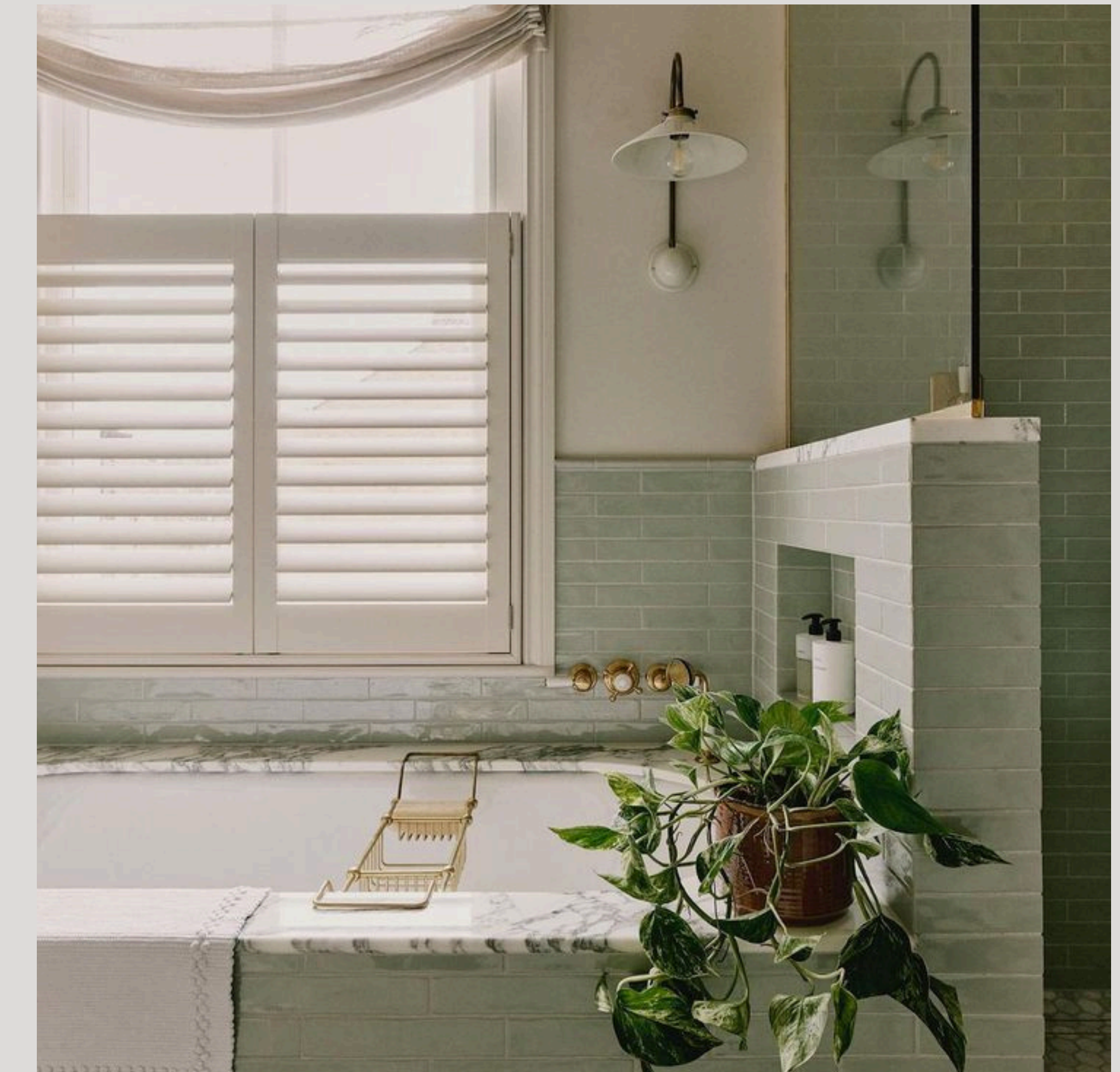
DESIGN CRED: STUDIO DUGGAN